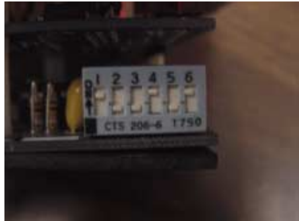
FIGURE 1 ADDRESS DIPSWITCHES SET FOR ZONE 22

In addition, the unit shall have a flashing red alarm LED that is visible up to fifty feet. It shall have a range of not more than fifty feet up to 70 degrees off-axis from any given transducer. It must be available in configurations that allow for cell, room, dayroom, corridor, laundry, shower and outdoor areas. It must also have configurations that allow for both single and dual transmission frequencies, latching or momentary receiver alarm and audio monitoring, if necessary.